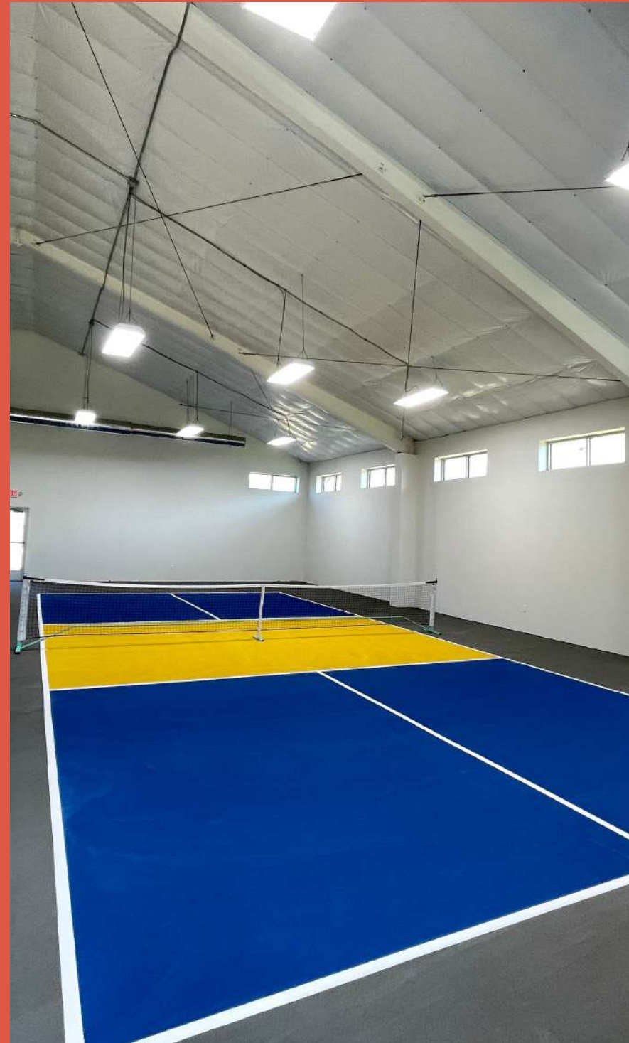
Let's Play Pickelball at Highland 55!